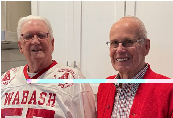
JB & Birdy